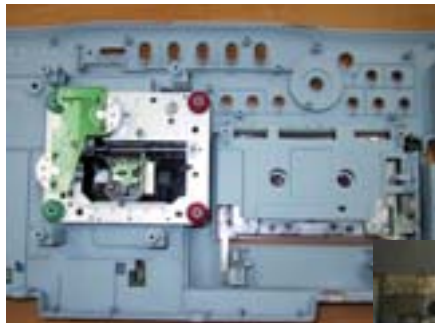
SLA sample after secondary treatment for a cassette player with radio

ARRK (Malaysia) Sdn. Bhd. responds quickly and decisively to your production needs. We work with you to understand your programme's constraints, and we take pride in completing your products on-time and within budget.