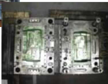
Mold for the parts showed in above picture